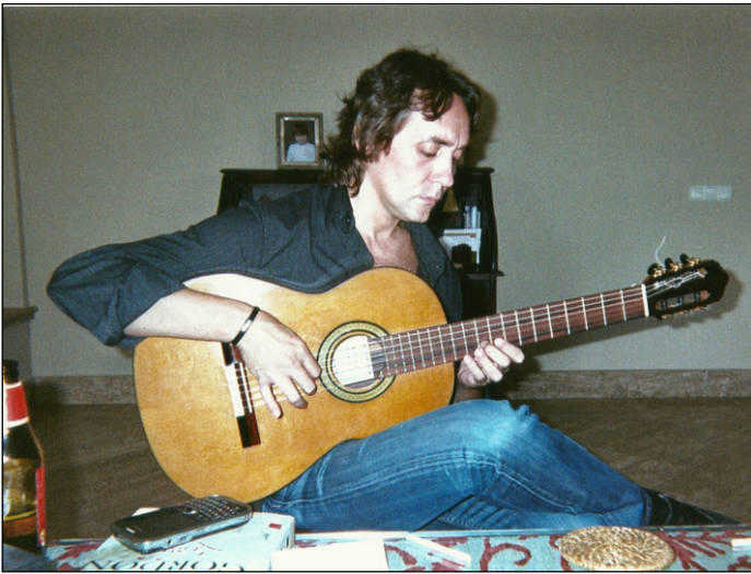
This 2003 cedar top negra is Vicente's current favorite guitar. Note the rosewood fingerboard. He ordered another guitar just like it!