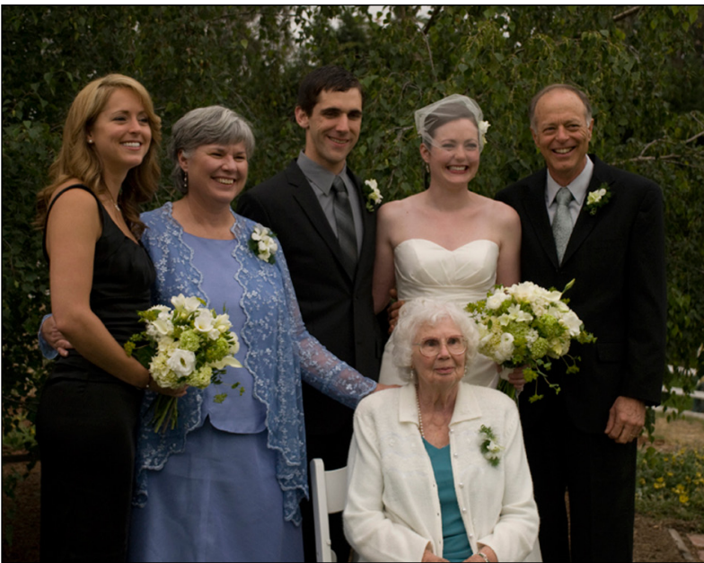
Wedding photo of family